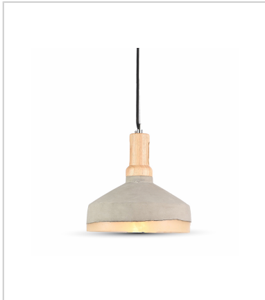
VT-7291 CONCRETE+ACRYLIC PENDANT LIGHT D:290